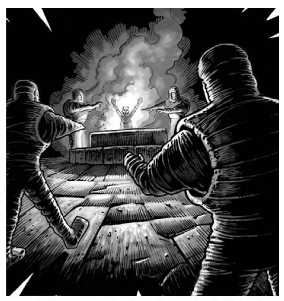
Each of the figures was seven feet tall. Heavy legs moving the body stiffly forward with a rolling motion that transferred the weight of the mummy from one leg to the other as the figure twisted its way forwards towards the central dais.