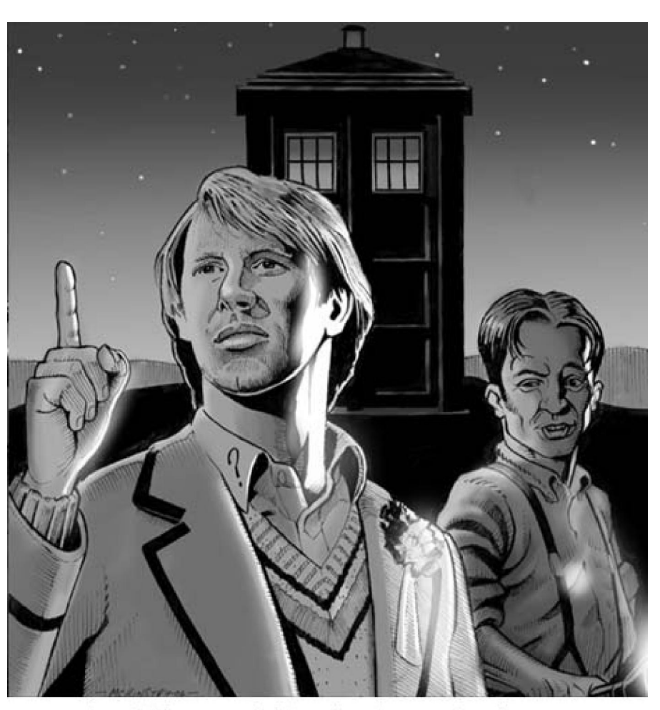
"Exactly," the Doctor smiled. "Now then ..." He twisted round trying to get his bearings, licking his index finger and holding it up. Then he stared out across the desert sands in the opposite direction to the crater. "That way, I think."