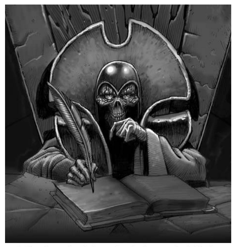
The Chronicler peered into the glowing embers of reality. Deep within the holosphere, a single quantum choice played itself out for him. He was at one with the world he watched, oblivious to the great hallway in which he worked...

'I think we're a little late,' the Doctor said. His voice was quiet, but everyone turned to him. Even Vanessa swung her head slightly. 'I'm afraid your calculations were slightly off. As you can see, Nyssa has actually been awake for quite some time. Or at least, in a sort of waking sleep. Just enough to continue the ageing process while she dozed.'