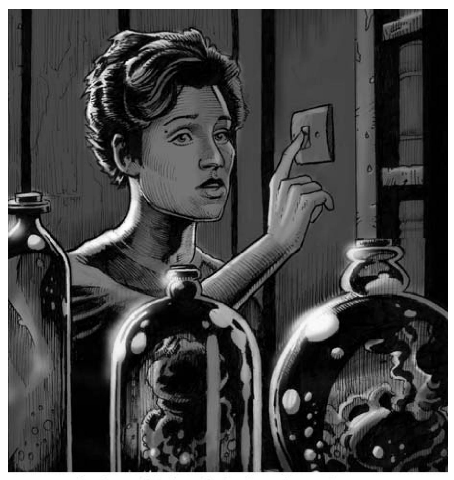
Her hand was on the light switch when she saw the rows of specimen jars. She was already in the process of turning out the light as she began to realize what the shapes floating inside the discoloured fluids might be.

As she turned the tap off, Tegan heard movement outside in the corridor. 'Hello,' she called, catching sight of a figure as it passed.