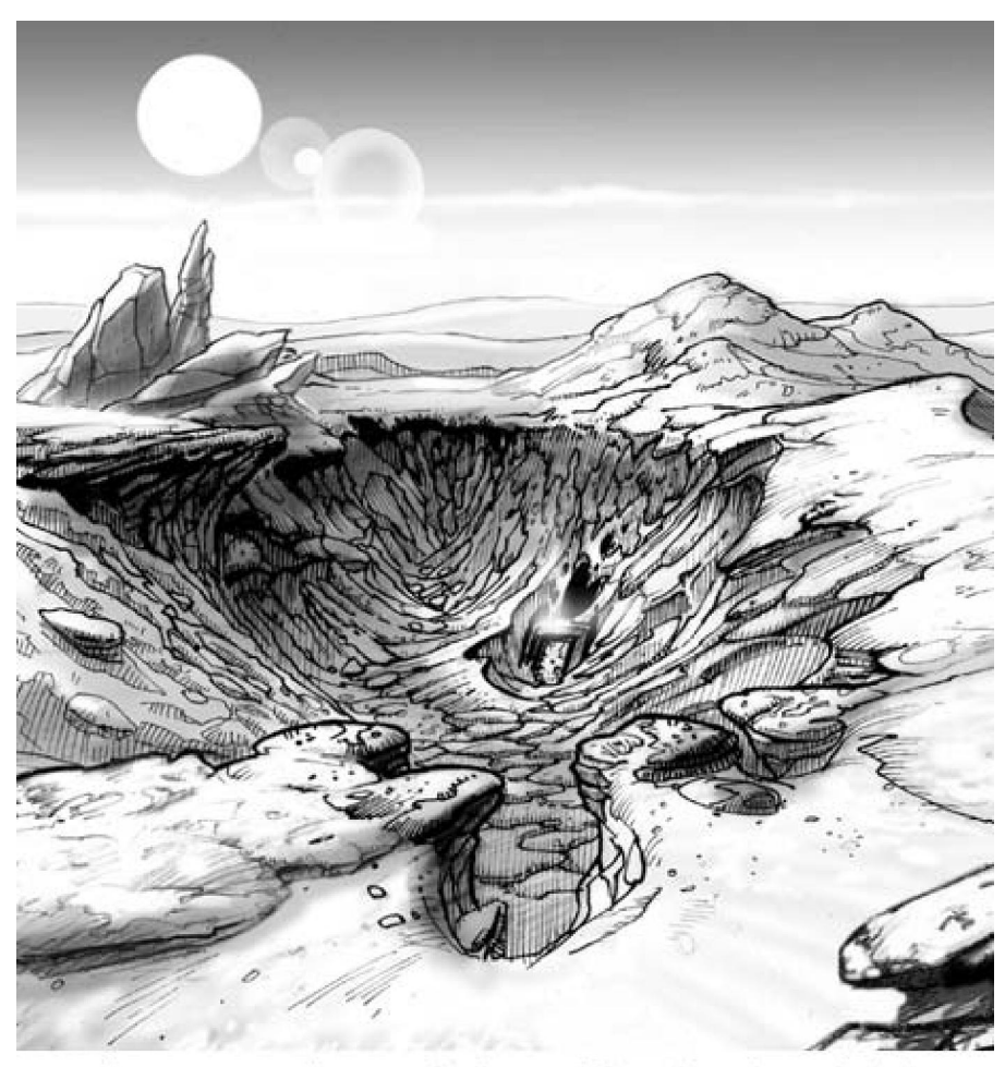
The excavation was a huge pit in the desert, at the base of a sandy mound. On the side of the pit below the mound, the wall of sand was interrupted by the shining black marble of the pyramid side.

And with a rumble of stonework, age, and weight, the heavy door opened slowly outwards. The Doctor's smile froze on his face. 'I don't like that,' he muttered.