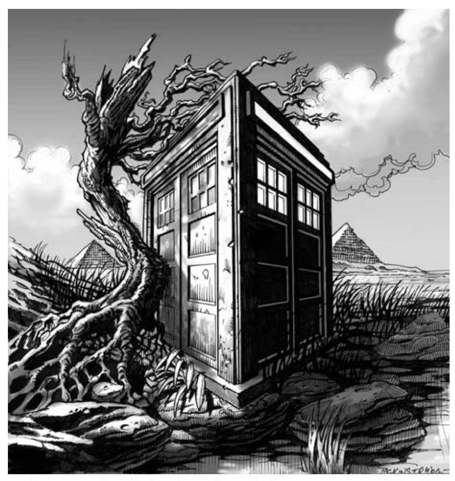
The tree quivered and shook as a heavy object washed up against it, jamming hard in the mud. In a moment it was quiet again. Just the river, the breeze, the reeds and the tree. And the solid blue box of the TARDIS stuck fast in the muddy bank of the ancient river Nile.

'An interesting phenomenon, Doctor,' he had commented. 'I'm sure his lordship would be most intrigued to examine it. He has an interest in such things, as I am sure you are aware.'