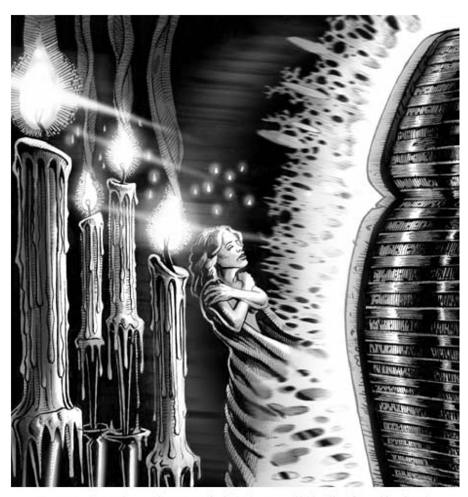
Nyssa was being drawn closer, into the kaleidoscope of light. She clasped her hands tightly over her shoulders as the blackness closed around her and Rassul's laughter faded into the hazy distance.

'Cross my heart,' Tegan's voice murmured in Nyssa's ear as she fell from consciousness and into the casket. 'Cross my heart, and hope to die.'