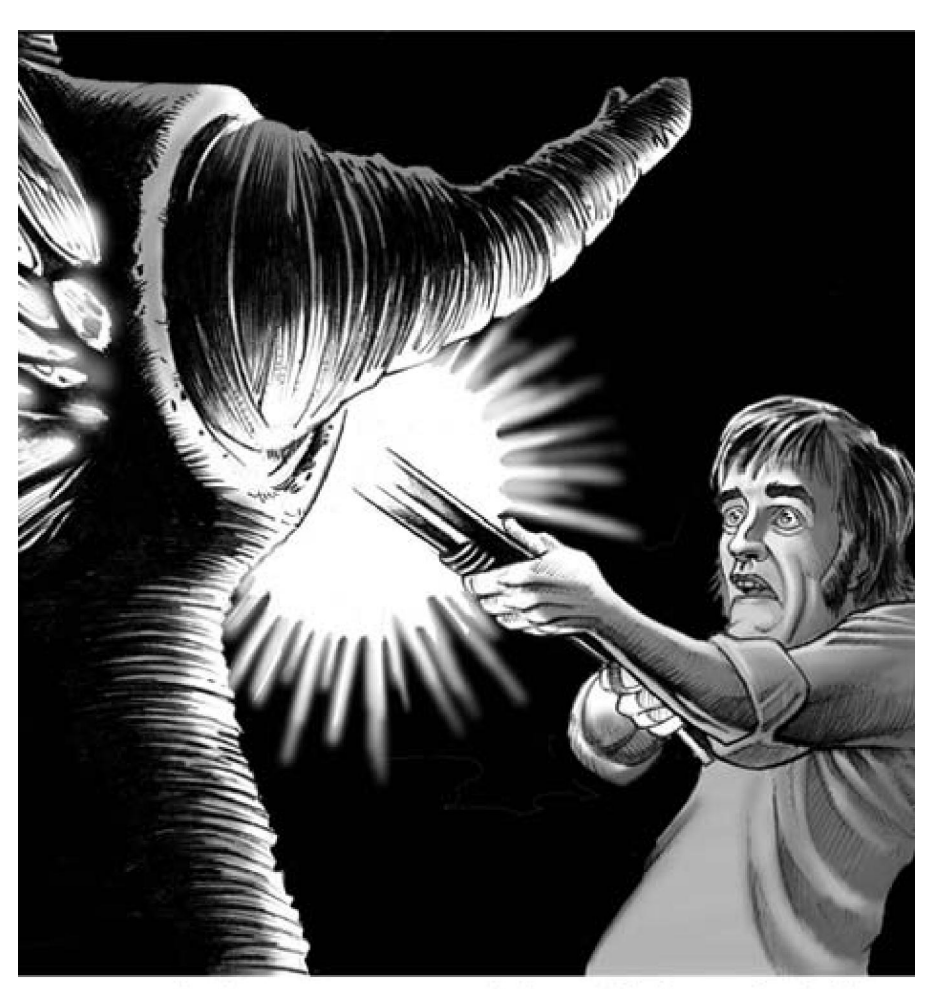
Norris gaped at the mummy in amazement. Then he raised the shotgun to his shoulder, and fired. One of the barrels spat flame, and the mummy lurched back under the impact. The bandages on the upper body tore and smoked as the lead shot ripped through.

The mummy took no notice, reaching out to brush aside the weapon just as Tegan closed her eyes and fired. The shot ripped up the mummy's outstretched arm and tore into its shoulder. It staggered back, cloth smouldering and torn across its chest. Then it smashed Tegan aside and continued inexorably across the room. It bent down in front of the couch, reaching out for Vanessa. Then, surprisingly gently, it scooped her limp body into its arms and lifted her up.